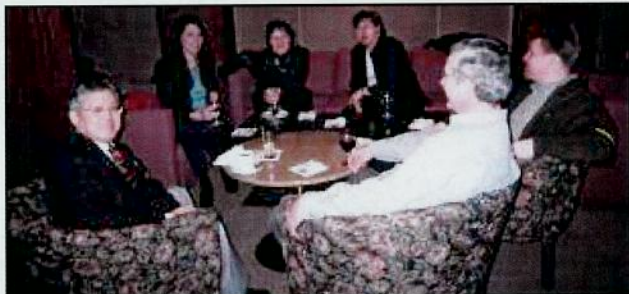
A group of members at the annual Christmas party.